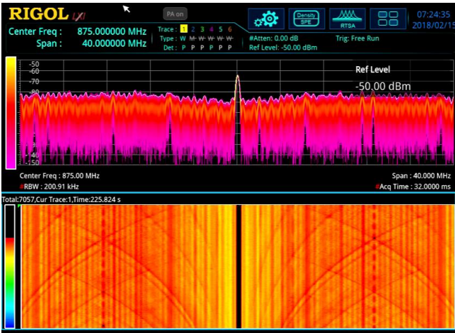
Figure 9: Debugging emissions with the density display (top) and the spectrogram waterfall chart (bottom)