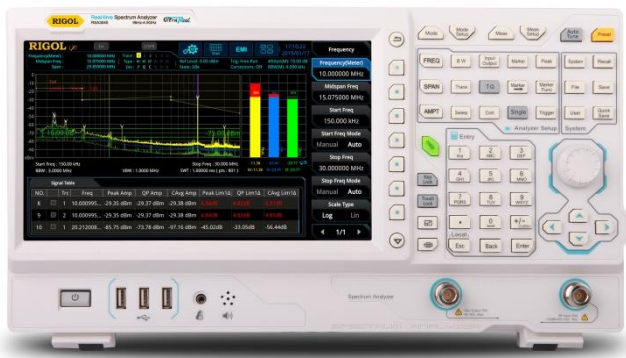
Figure 1: RIGOL RSA3000 Spectrum Analyzer with EMI