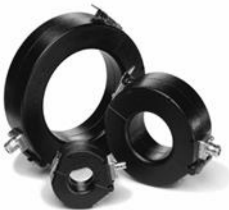
Figure 4: RF Current Probes for Conducted Emissions