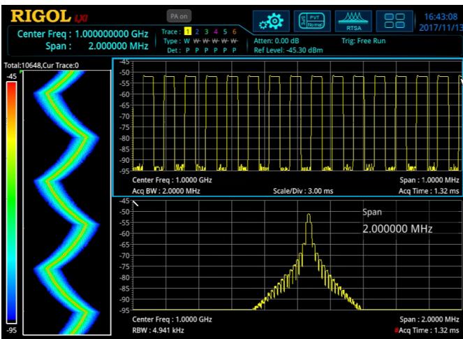
Figure 10: Debugging with a combined view of the spectrum (bottom), power over time (top), and spectrogram (left)

EMC Compliance testing is mandatory for the majority of electronic products that are slated for sale throughout the world. Select your instruments and design your test setup to get the most out of your EMI budget for any Pre-Compliance use case. With the right spectrum analyzer, visualize emissions with near field and RF probes. Then, validate EMI pre-compliance measurements against known emissions data. Finally, debug and time correlate signals of interest to improve the design. These pre-compliance test setups will help speed product development and save time and money in your design process.