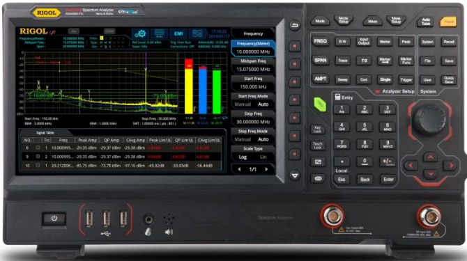
Figure 6: RIGOL RSA5000 Series Real-Time Spectrum Analyzer with EMI

significant power switching frequencies back into the power line. After visualizing these signals care can be taken to filter or improve them if needed before further analysis.