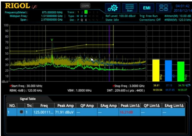
Figure 7: EMI Mode using limits, multiple detectors, and meters on a RSA Series Real-Time Spectrum Analyzer