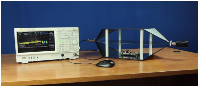
Figure 8: A TEM Cell for repeatable radiated emissions testing

The EMI measurement mode provides the RSA Series spectrum analyzers with limits and CISPR detector modes including Quasi-Peak, CISPR Average, and RMS Average. Engineers also have access to the standard EMI resolution bandwidths (200 Hz, 9 kHz, 120 kHz, and 1 MHz). EMI mode ( Figure 7 ) operates entirely within the instrument from the touch screen or with a mouse and keyboard. This makes it easy to archive reports, run scans, and jump to a signal of interest and immediately debug when needed. The bar graph on the right shows real-time measurements at a given frequency of interest. This utility is made to quickly move to a signal of interest right after a scan without having to change modes. It can show live measurements on up to 3 detectors at the frequency of interest providing an easy transition to debugging and further analysis.