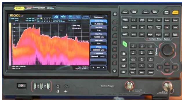
Figure 5: Conducted Emission profile of an LED light fixture

Near field probes pick up emissions that pass through the small loop at the end of the probe. These magnetic probes are relatively inexpensive and make it possible to capture signals only in close proximity to the probe, hence the name 'near field' probe. This makes them well suited to basic visualization because engineers can quickly scan a new board or enclosure looking for problems by passing the probe over the area as demonstrated in Figure 3 . A basic configuration of a near field radiated emissions test would be simply configuring the analyzer to use the peak detector and set the RBW and Span for the area of interest per the regulatory requirements for your device. The Peak detector will provide you with a "worst case" reading on the radiated RF and it is the quickest path to determining the problem areas. Then select the proper H field probe for your design and scan over the surface of the design. Larger probes will give you a faster scanning rate, albeit with less spatial resolution.